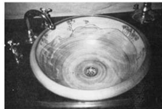
A handmade basin crafted by a local potter in Buninyong, Vic.