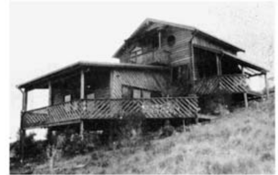
Pole frame houses revisited — page 16.