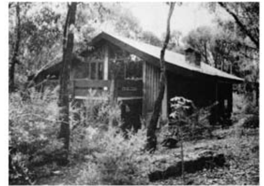
A Knox house at home in the bush.

Inside Back Childrens playhouse in the garden of an owner built home in Lilydale, Vic