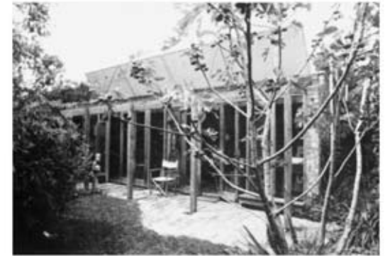
The Cuthbert house in South Melbourne

Back Cover: A form for making decorative mud bricks.