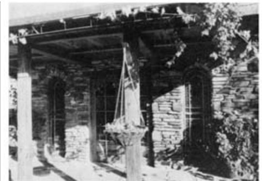
Fine stonework on the Davidson house.